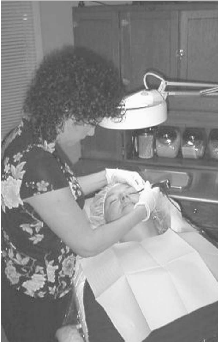
Special to THE GAMECOCK

A customer receives permanent eye makeup via tattooing. Such tattooed makeup usually lasts from one to three years and might need to be touched up at least once.