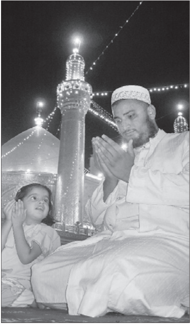
An Iraqi father and daughter offer prayers on the first day of Ramadan at the Shiite holy shrine of Imam Ali, in Najaf, 100 miles south of Baghdad, Iraq, on Monday Sept. 25. The start of Ramadan was punctuated with sporadic violence around Iraq, including an assault on a police station and the discovery of more apparent victims of sectarian death squads in the capital.