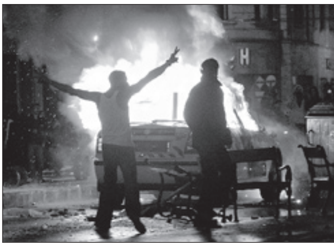
Hungarian right-wing demonstrators jubilate as they set a police car on fire after occupying one of the main roads during an anti-government protest in Budapest, Hungary, on early Wednesday, Sept. 20. Demonstrations started on Sunday calling Hungarian Prime Minister Ferenc Gyurcsany to resign. On Tuesday protesters clashed with police and stormed the headquarters of Hungarian State Television in anger over a leaked recording of Gyurcsany admitting officials had "lied morning, evening and night" about the real status of the economy.