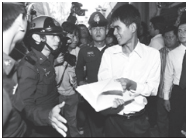
Thai police officers surround a student and ask him not to distribute leaflets outside a shopping mall in Bangkok, Thailand, on Friday, Sept. 22. A group of Thai protesters later showed up with banners and dispersed after staging a one-hour protest.