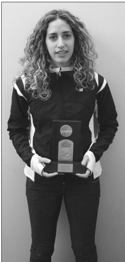
USA NAHILL/the Justice