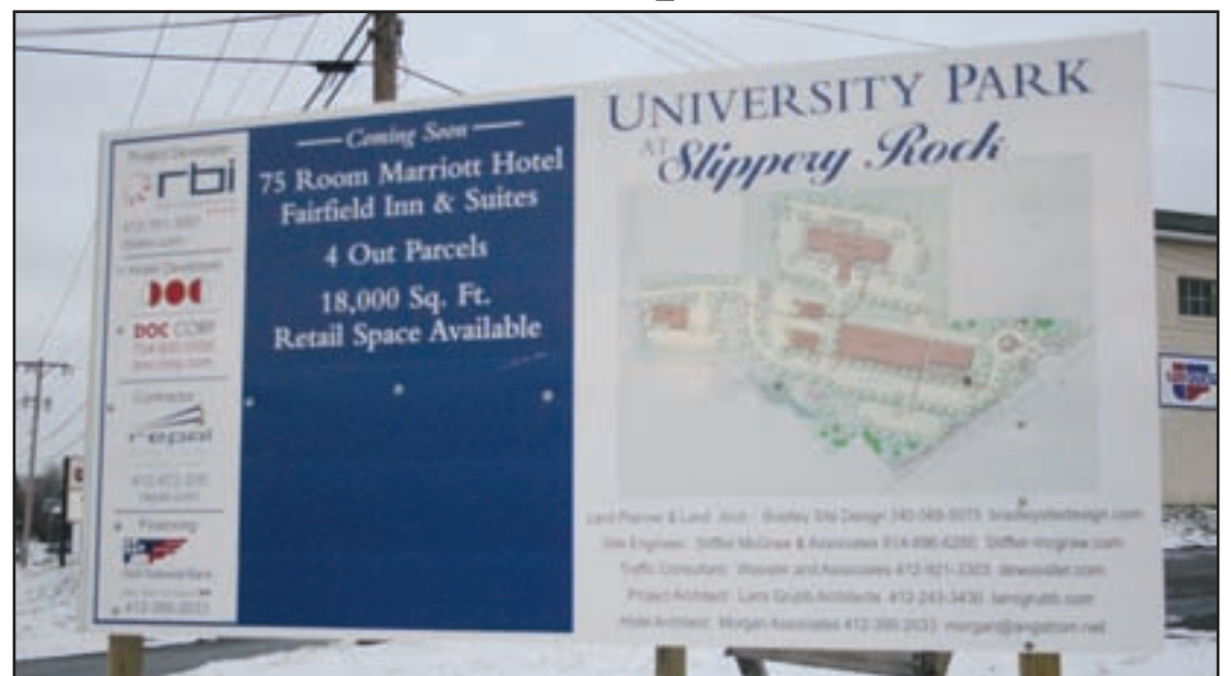
University Park at Slippery Rock will be providing a 75-room Marriott Hotel along with restaurants and shops. The development is set to be complete during the fall of 2008.