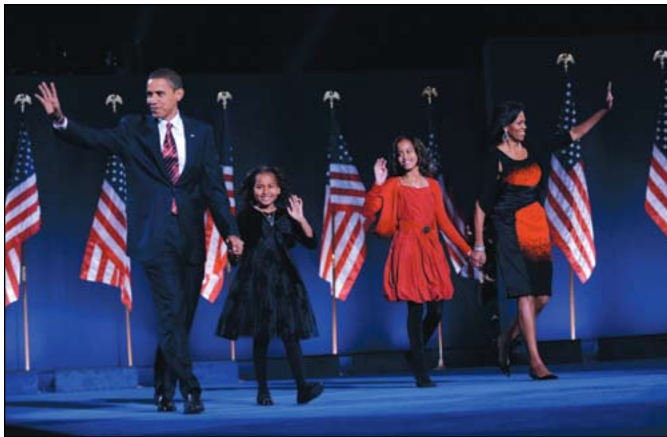
Students interested in attending the Jan. 20, 2009, inauguration of President-elect Barack Obama could have a chance to go with the Center of Leadership and Community Engagement.

The proposed fund allocation as it was presented to the Associated Student Government is: $10,000 from the ASG, $4,000 from Residents' Interhall Congress, $2,000 from Housing Initiatives for Student Success (HISS funds), $1,000 from the Multicultural Center and $1,000 from the