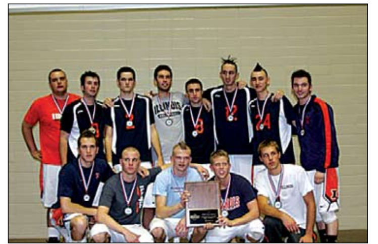
The Illinois Men's Club Volleyball team poses after its second place finish at the Club National Volleyball Championships in Dallas.

Noteworthy season shows drive, talent of UI men's volleyball