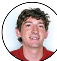
MIKE THEODORE Staff writer

Covering wrestling, softball and football the past two years, I am privileged and thankful to have seen a side of Illinois athletics many covet but few realize. In just more than 100 bylines, I've been provided with an incredible