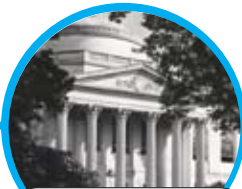
Wilson Library, named for the University librarian

The library (and the Bell Tower) can be seen in a flyover shot in "Kiss the Girls" (1997,) starring Ashley Judd and Morgan Freeman.