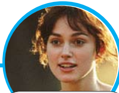
Knightley in "Pride and Prejudice" (2005)

Carolina soccer phenom Mia Hamm receives special thanks in the credits of "Bend it Like Beckham" which co-starred Keira Knightley.