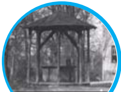
The original old well kept the campus hydrated.

With UNC-Chapel Hill celebrating its 214th birthday this University Day, a little game of Six Degrees was bound to turn up some interesting links to the campus. So go to the ceremony, eat some cake and marvel in the ties that bind us together.