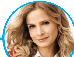
Sedgwick, married to Bacon since 1988

Tom Cruise starred as a paralyzed Vietnam vet in "Born on the Fourth of July" (1989) with leading lady Kyra Sedgwick.