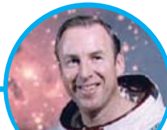
James A. Lovell, mission astronaut on Apollo 13

Between 1959 and 1975, almost all astronauts participating in space programs (including Apollo) trained at Morehead.