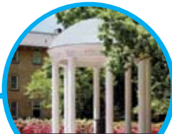
Old Well, inspired by the Temple of Love