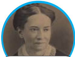
First women's dorm named after Cornelia Phillips Spencer

Lovell coached space navigation to the cast of 1995's "Apollo 13," which included Tom Hanks, Bill Paxton and Kevin Bacon.