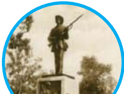
Silent Sam, erected in 1913, faces Franklin Street.

"Uncle Buck" John Candy starred in "Planes, Trains & Automobiles" (1987), in which Bacon played a taxi racer.