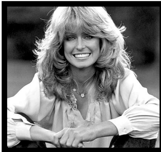
Charlie’s Angels star and sex symbol passed away at the age of 62.

Ed McMahon is most famously known for being an announcer and co-star on the “Johnny Carson Show,” the show which he was a part of for 30 years. According to a recent article by Entertainment Weekly, he was considered one of television’s “greatest sidekicks.” McMahon could be heard laughing through many portions of the Johnny Carson Show, which gained him the nickname “The Human Laugh Track.” He’s also famous for his “Here’s Johnny” opening line that had also resonated to the big screen, thanks to Jack Nicholson, in the horror film “The Shining.” McMahon died on June 23rd from natural causes at the age of 86.