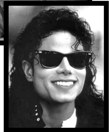
The King of Pop lives on after death.

Jackson received a daily dose of Demerol, a pain-killer which he had been addicted to for several years. Jackson died on June 25th at the age of 50.